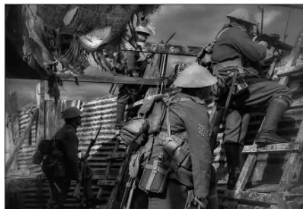
Poised to go over the top? German lines could be 200 yards away.