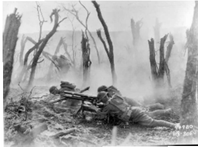
Machine gun crew amongst the shell holes of No Man's Land.