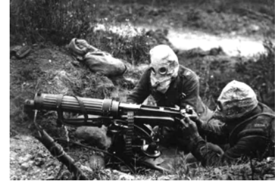
Battle of the Somme 1916. Note the early version of the poison gas mask.