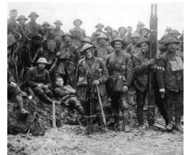
Men of the Manchester Regiment at Serre in France. Find out where Serre is.