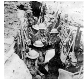
British troops entrenched on the Western Front.