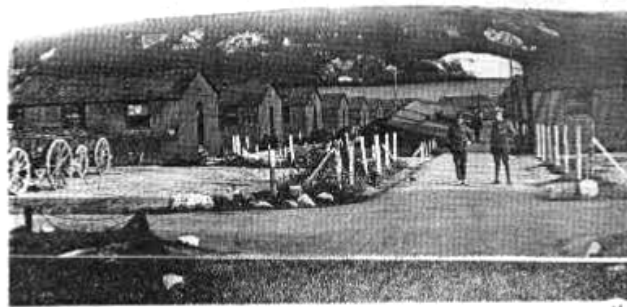
Fovant Camp, 1918

If those children had been standing in the same place in 1918 this is what they would have seen in the fields below.